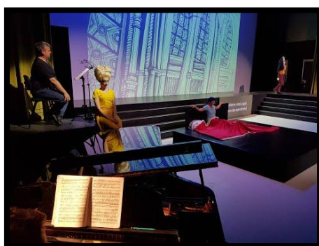
Rossini – Le comte Ory, Budapest Opera https://youtu.be/BZ0gxbNObf4